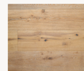
Aged Smoked &amp; Limed