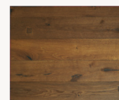
Antique Ale Brown